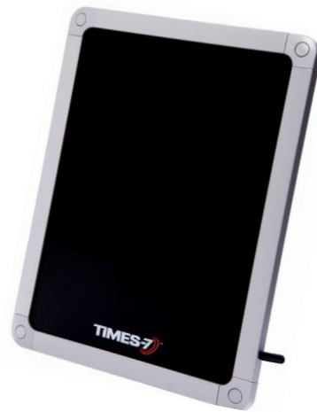
The SlimLine A6031